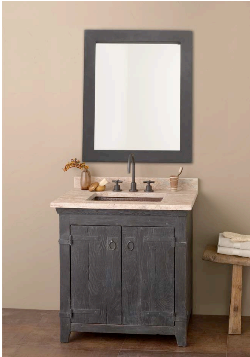
Cuzco mirror with new Black Old World Vanity Base

For a less ornate statement in iron that fits a variety of styles, the Cuzco mirror is a 28.5 x 34 inch rectangular mirror with a solid four-inch border.